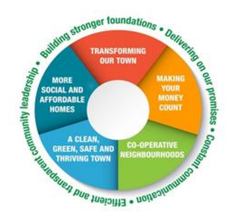
Figure 1: Future Town, Future Council Programme

3.1 Members approved the FTFC Cooperative Corporate Plan in December 2016. This sets the Council's focus on cooperative working and outlines the key outcomes and priorities for the town through the Future Town, Future Council (FTFC) Programme as seen in Figure 1.